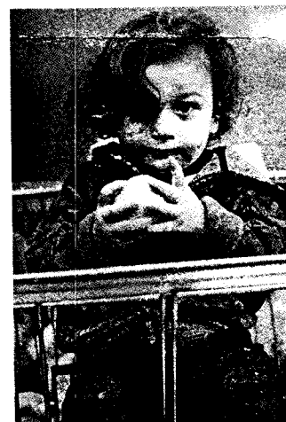
1 in 5 children are food insecure

We appreciate your continued dedication as we lead the fight against hunger together and look forward to working with you again soon!